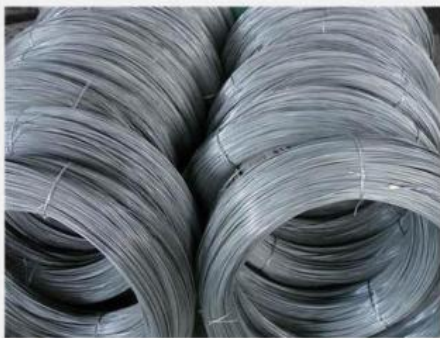
Stainless steel cold drawn wire is widely used in construction, industry, chemical products, etc.