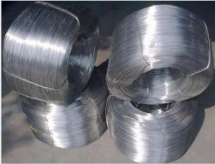
Stainless steel spring wires are widely used in electron, chemical and medical equipment, etc.